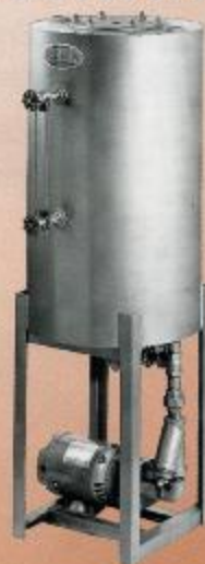
RETURN SYSTEMS & TANKS

• Responsive Service • Highest Quality • Competitive Pricing