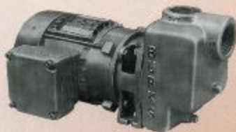
PUMPS BY BURKS